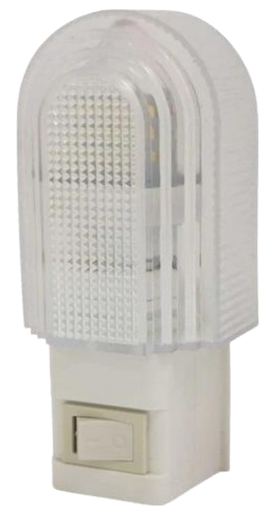
NL1985 NIGHTLIGHT WITH SWITCH (REPLACEABLE LED)